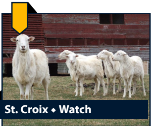
St. Croix ♦ Watch

recovering breeds once at-risk that have exceeded Watch category numbers, but are still in need of monitoring