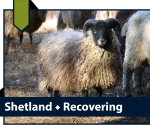
Shetland ♦ Recovering