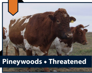
Pineywoods ♦ Threatened

We support a network of breeders, breed associations, and farmers. We also help gene banks identify important genetic materials that should be collected from endangered breeds.