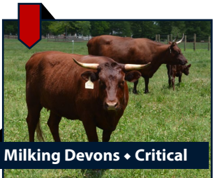
Milking Devons ♦ Critical