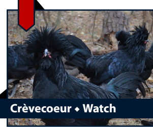
Crèvecoeur ♦ Watch