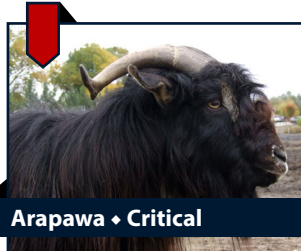
Arapawa ♦ Critical