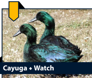
Cayuga ♦ Watch