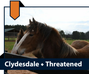
Clydesdale ♦ Threatened

critical fewer than 200 annual registrations in the United States and estimated global population less than 2,000