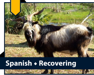
Spanish ♦ Recovering