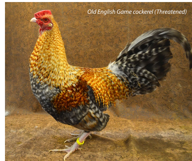
Old English Game cockerel (Threatened)

Every heritage chicken breed listed on the Conservation Priority List offers valuable genetic characteristics needed for the future of agriculture and rare poultry conservation.