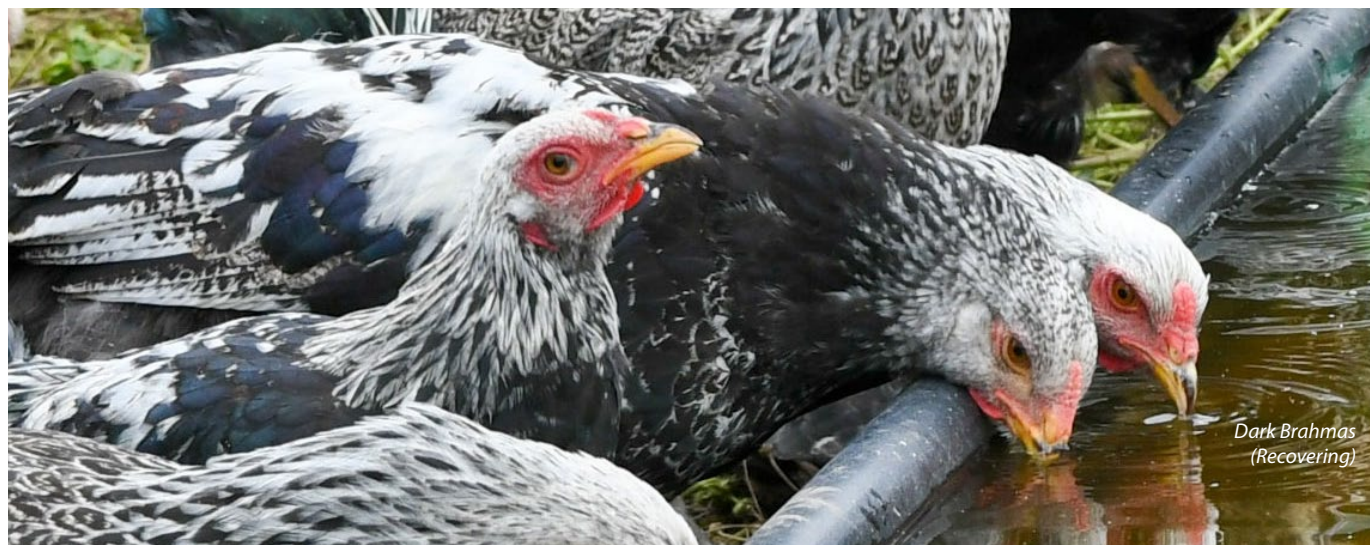
Dark Brahmas (Recovering)

The outstanding characteristic of heritage breed meats and eggs is flavor. Slower growth means these birds have more time to incorporate the “terroir” of the land they live on and the foods they eat. Heritage chickens naturally love to range and they will forage on a wide variety of food items. This creates a diverse and sometimes intense flavor profile in their meat and eggs and makes for an amazing culinary experience.