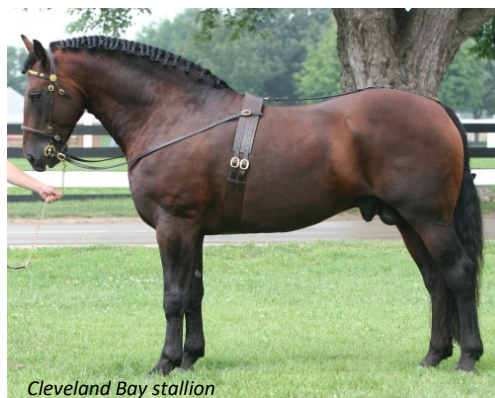
Cleveland Bay stallion

Chemical ejaculation —In situations where standard semen collection is not possible, chemical ejaculation can be used to collect sperm for cryopreservation. The stallion does not have to travel to be collected, but can instead be collected at home under the supervision of a trained veterinarian. A medication is administered to reduce the threshold for ejaculation, which sedates the horse. In many cases, sedation will cause ejaculation and the concentrated fresh sperm can be harvested and shipped directly to a cryopreservation facility. Cost is variable for the sedation procedure (your veterinarian); cryopreservation of shipped semen can cost about $500-$750 per ejaculate.