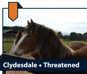
Clydesdale ♦ Threatened