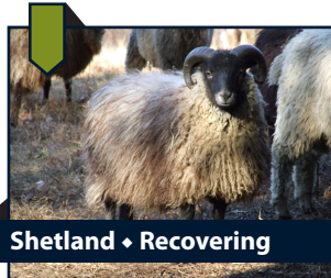
Shetland ♦ Recovering