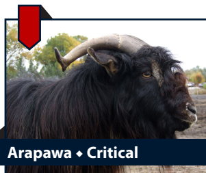
Arapawa ♦ Critical