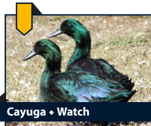
Cayuga ♦ Watch