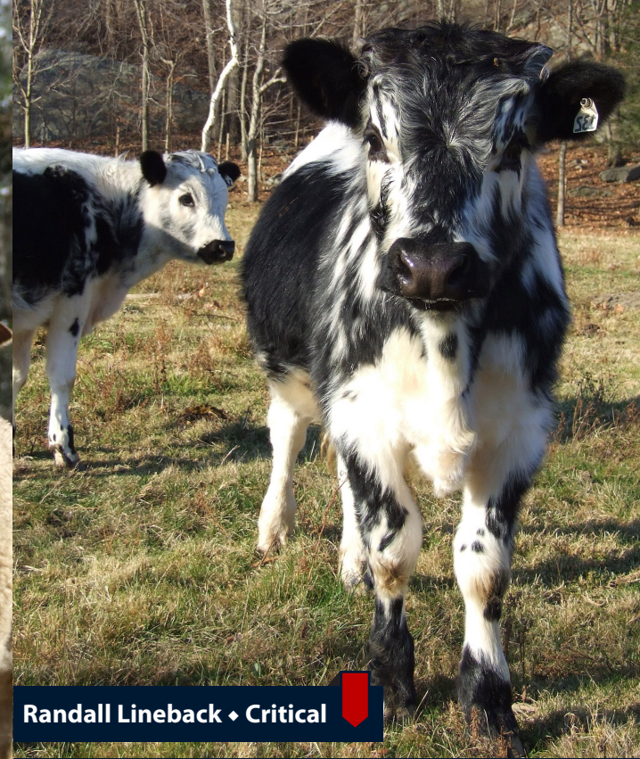
Randall Lineback ♦ Critical