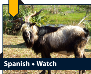
Spanish ♦ Watch