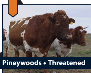
Pineywoods ♦ Threatened

We support a network of breeders, breed associations, and farmers. We also help gene banks identify important genetic materials that should be collected from endangered breeds.