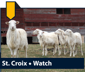
St. Croix ♦ Watch

breeds once at-risk that have exceeded Watch category numbers, but are still in need of monitoring