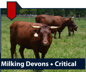
Milking Devons ♦ Critical