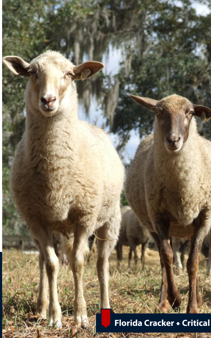
Florida Cracker ♦ Critical

Follow us on social media! @livestockconservancy