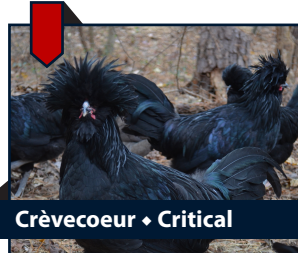
Crèvecoeur ♦ Critical