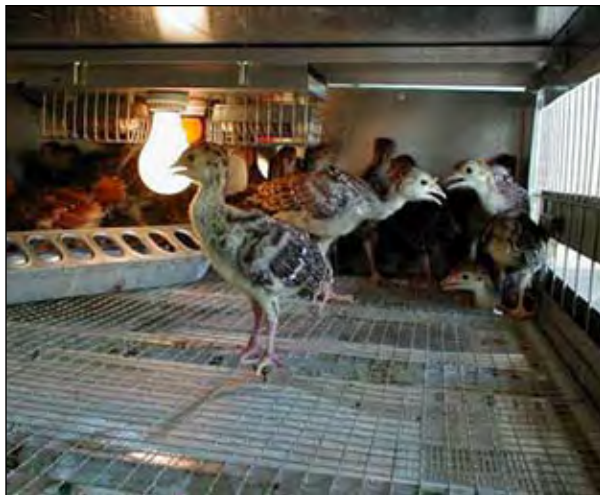
Turkey poults in brooder with mesh flooring.

Keeping poults up off the floor at about 36 inches will lower heating cost as only the air, and not the ground will need to be heated. Running a ceiling fan on low and moving air toward the ceiling will warm air trapped near the ceiling and circulate air to prevent cool spots from occurring in the brooding area without creating a draft on the poults.