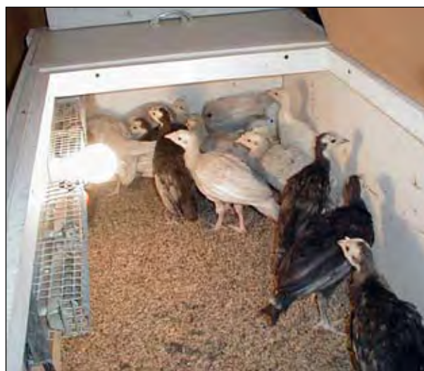
Turkey poults in brooder.

If the brooder has been used before, disinfect it before introducing a new flock. Several weeks before any poults arrive, the building, brooder, and other equipment associated with the poults should be thoroughly cleaned and disinfected to prevent any contamination from pathogens that may be present from previous flocks, other livestock or wildlife. Use one of the phenol or quaternary ammonium compounds available