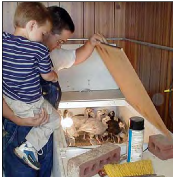
Checking turkey poults in brooder.

The poults will need heat for their first 4 to 5 weeks of life. Once they have arrived, monitor the warmth of the brooder at least twice daily. When the brooder is a comfortable temperature, the poults will roam all around. If they are snuggled under the lamp, increase the temperature. If they are scattered to the edges of the brooder, reduce the temperature. Raise the height of the